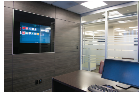
IN WALL MONITOR