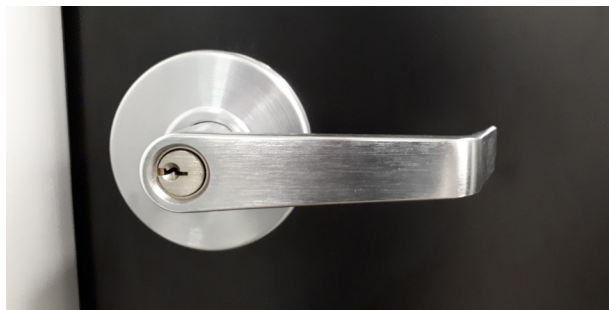
SOLID DOOR LEVER