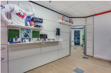
SHELVING & CANTILEVER BRACKETS