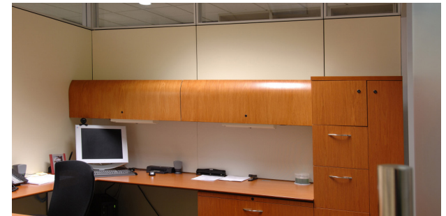
WALL HANGING ABILITY

IMT has a variety of hardware and accessories to complete your modular partitions and give your office space the personalized look you want. We can provide brackets to work with any furniture manufacturer to get the greatest return on your investment.