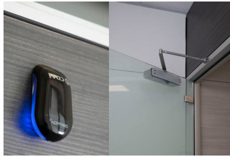
ELECTRIC STRIKES/DOOR CLOSER