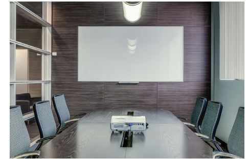
WHITE BOARD/SLOT WALL