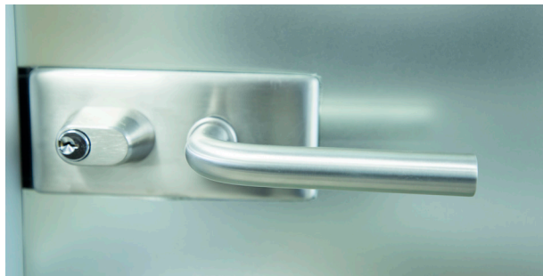
GLASS SWING DOOR LEVER