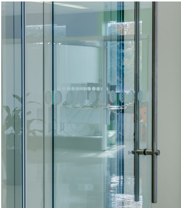
SLIDING DOOR LADDER PULL